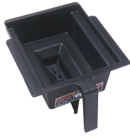
FUNNEL W/DECAL,PPK NAR BLK(LG)