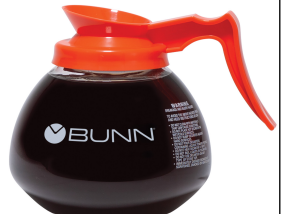
DECANTER, GLASS-ORN 12 CUP 1PK