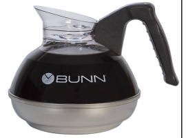
EASY POUR®,(BLK) 12/CS