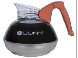
EASY POUR®,(ORN) 24/CS