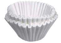
FILTERS,REGULAR1M 50/2 50/CL