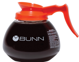
DECANTER, GLASS-ORN 12C 3/CS