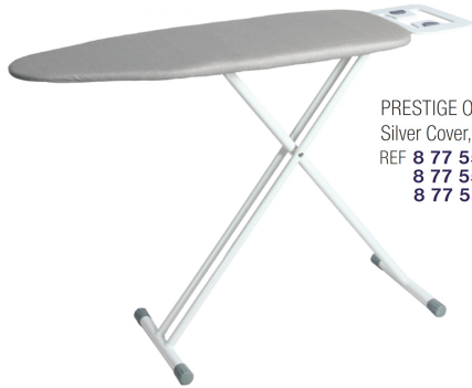
PRESTIGE Off-White Silver Cover, UPC 2 REF 8 77 552-EB 8 77 556-EB 8 77 555-EB