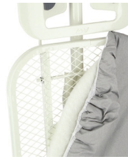
Bungee cover & padding in one-piece