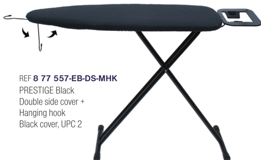
REF 8 77 557-EB-DS-MHK PRESTIGE Black Double side cover + Hanging hook Black cover, UPC 2