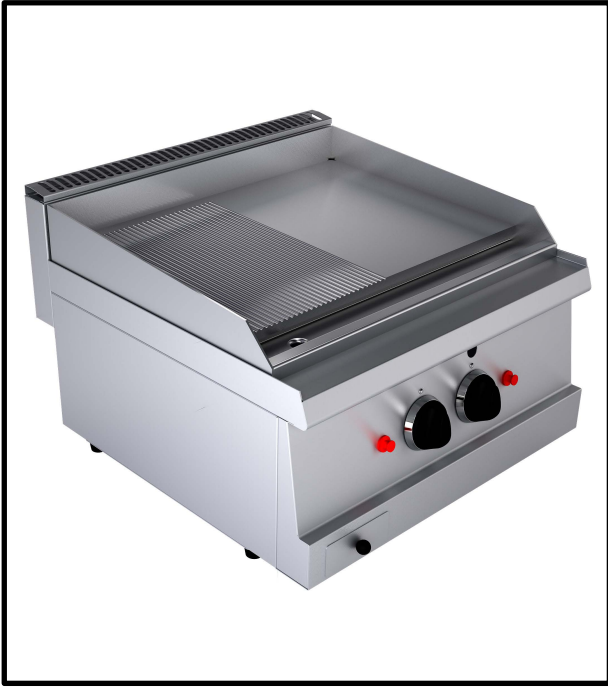
fry top smooth + fully ribbed 7kW