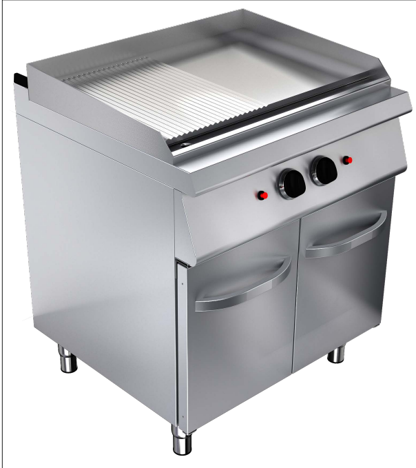
fry top smooth + fully ribbed 13 kW