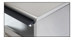
Disappearing insulated door