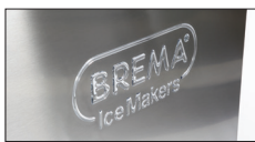
AISI 304 SS Scotch Brite finish