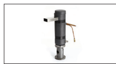
AISI 304 SS evaporator