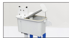
Dust-proof water basin