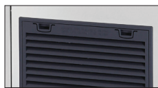
Removable and cleanable air filter