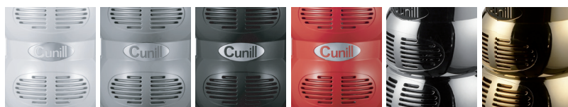
WHITE GREY BLACK RED SILVER CHROMED GOLD CHROMED