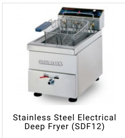
Stainless Steel Electrical Deep Fryer (SDF12)

Over heat reset switch - prevents over heating