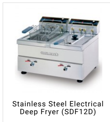
Stainless Steel Electrical Deep Fryer (SDF12D)